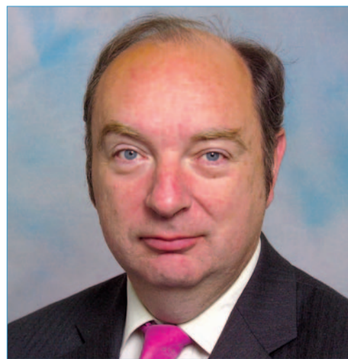
Norman Baker MP, Parliamentary Under Secretary of State